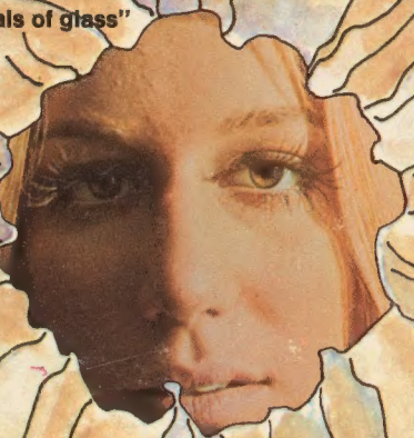
"Skin shining soft as a dove"